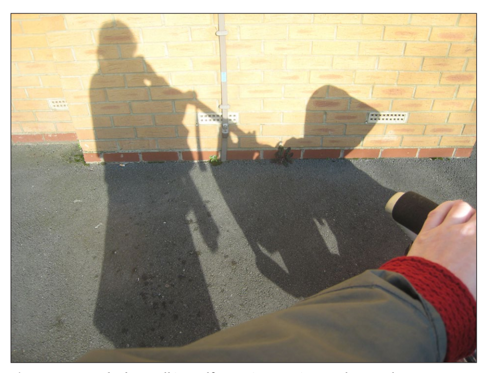
Figure 1: Pram Shadow, walking self portrait, 2012, image Clare Qualmann.

Viewing the city through this new lens feels political. Losing the freedom of easy mobility – a freedom that I hadn't been aware of before – connects me to a massive group of people (predominantly women) in the same position, encumbered by wheels. This became the premise for Perambulator – making this visible through a mass walking with prams. So, simply, pram users were invited to meet at the gallery, and go for a walk around the neighbourhood.