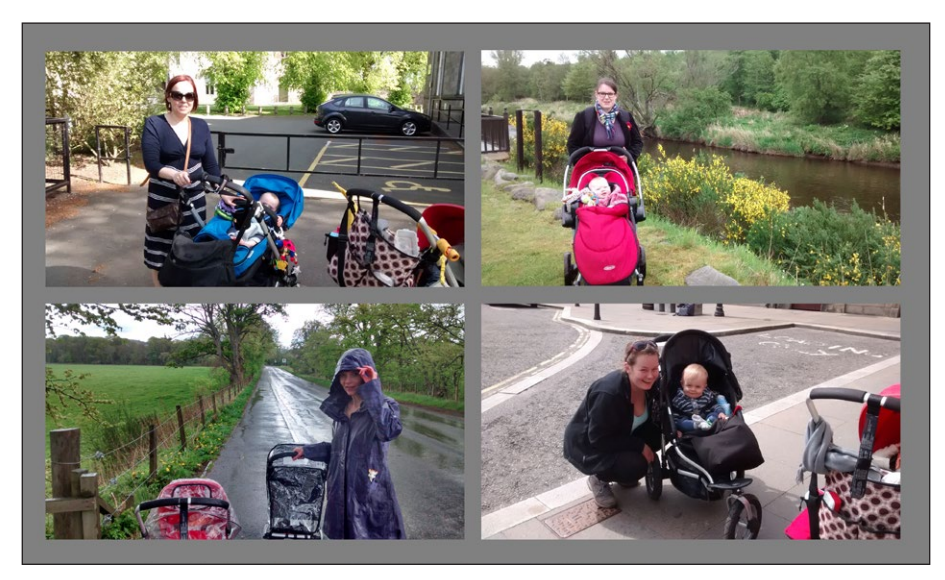
Figure 4: Pram Walks, Huntly, 2014, image: Clare Qualmann.