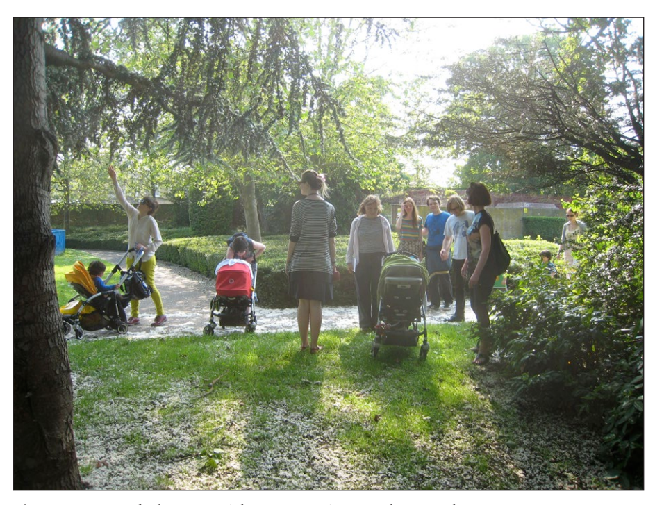
Figure 3: Perambulator, Lewisham, 2012