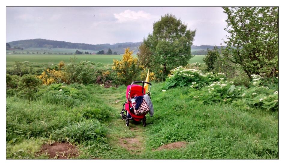
Figure 8: By the River Deveron, Huntly, 2014.