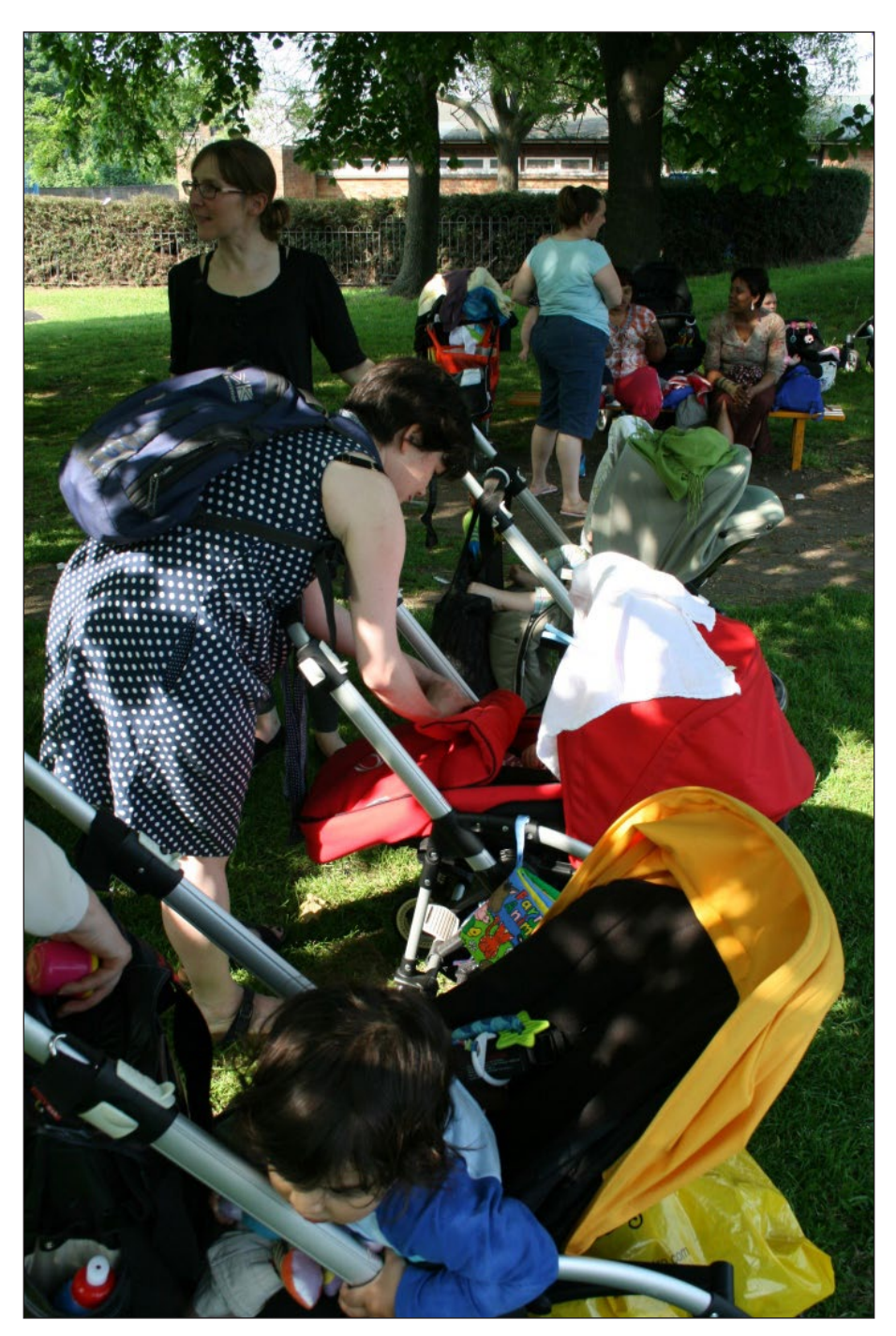
Figure 2: Perambulator, Lewisham, 2012, image Candida Powell-Williams.