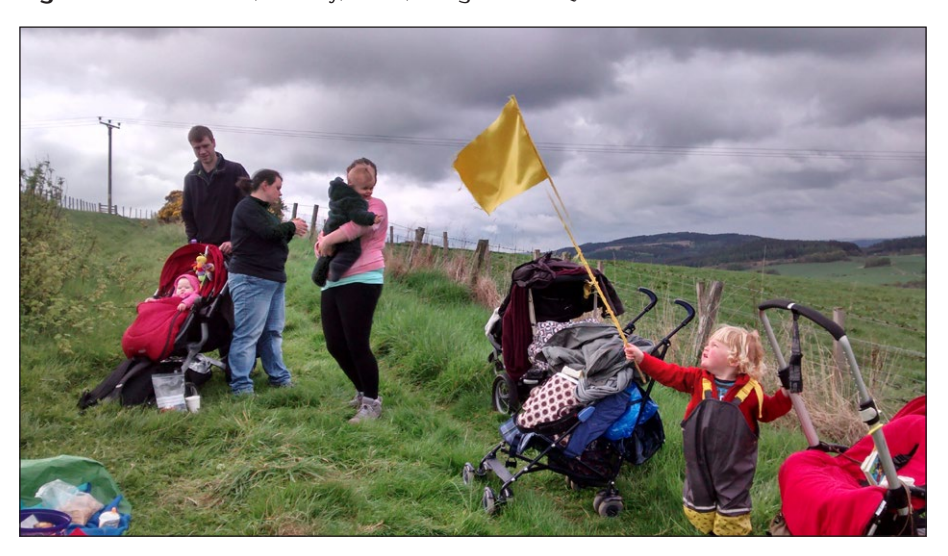
Figure 5: Baby Slow Marathon, Huntly, 2014, image: Clare Qualmann.

As the project progressed people told me about the horrors of navigating the pavements on bin day, about forest walks they used to do before they had kids, about different approaches to walking-for-napping. I took a large map into playgroup and asked people to mark awkward spots, narrow pavements, steep steps, slippery surfaces. This process helped to shape plans for the Perambulator Parade ,