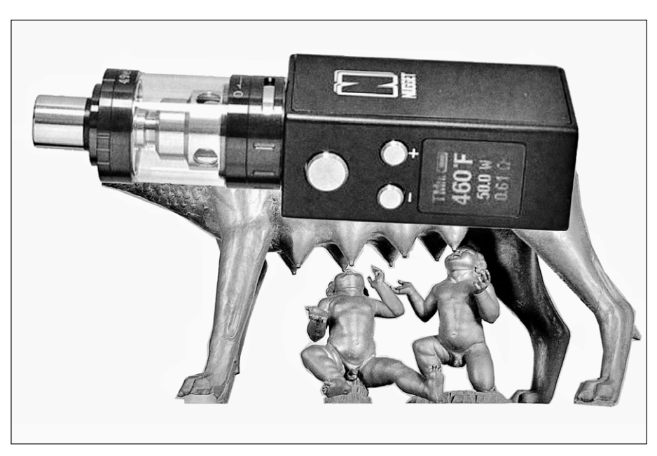
Figure 2: We wished to critique the insidious militarization of public health-care and private reproductive life.

proposes a "solution" to the "problem" of women's notorious resistance to being controlled" ( Figure 2 ):