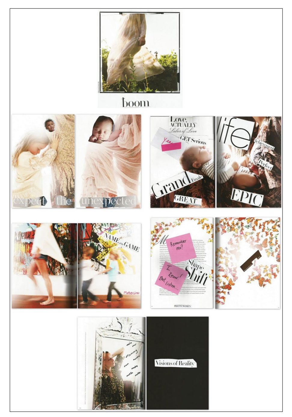
Figure 2: Altered book 2: Boom.

Scotti and Prentice: Altered Coffee Table Books as an Inquiry into Transitioning to Motherhood